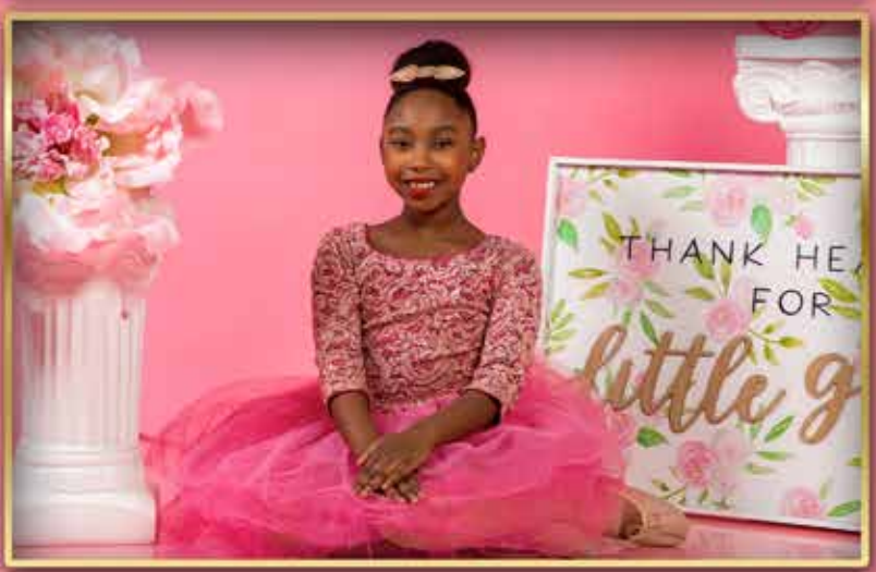
Dance like nobody's watching! We're so proud of you! Love, Mom & Dad